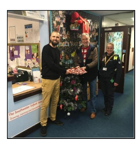
18/12 – Together with Southwater Parish Council, we held a 'Are you Scam Savvy' event at Beeson House presented by the Digital Safety and Fraud Team from West Sussex County Council. The presentation was offered to anyone who wanted to stop themselves falling victim to different types of scams.

Further free support is offered by appointment only by the team of Library Digital Volunteers on a range of digital enquiries from setting up an email account, to help with online shopping or being safe online. To find out more or to arrange for some digital support, please contact your local library directly.